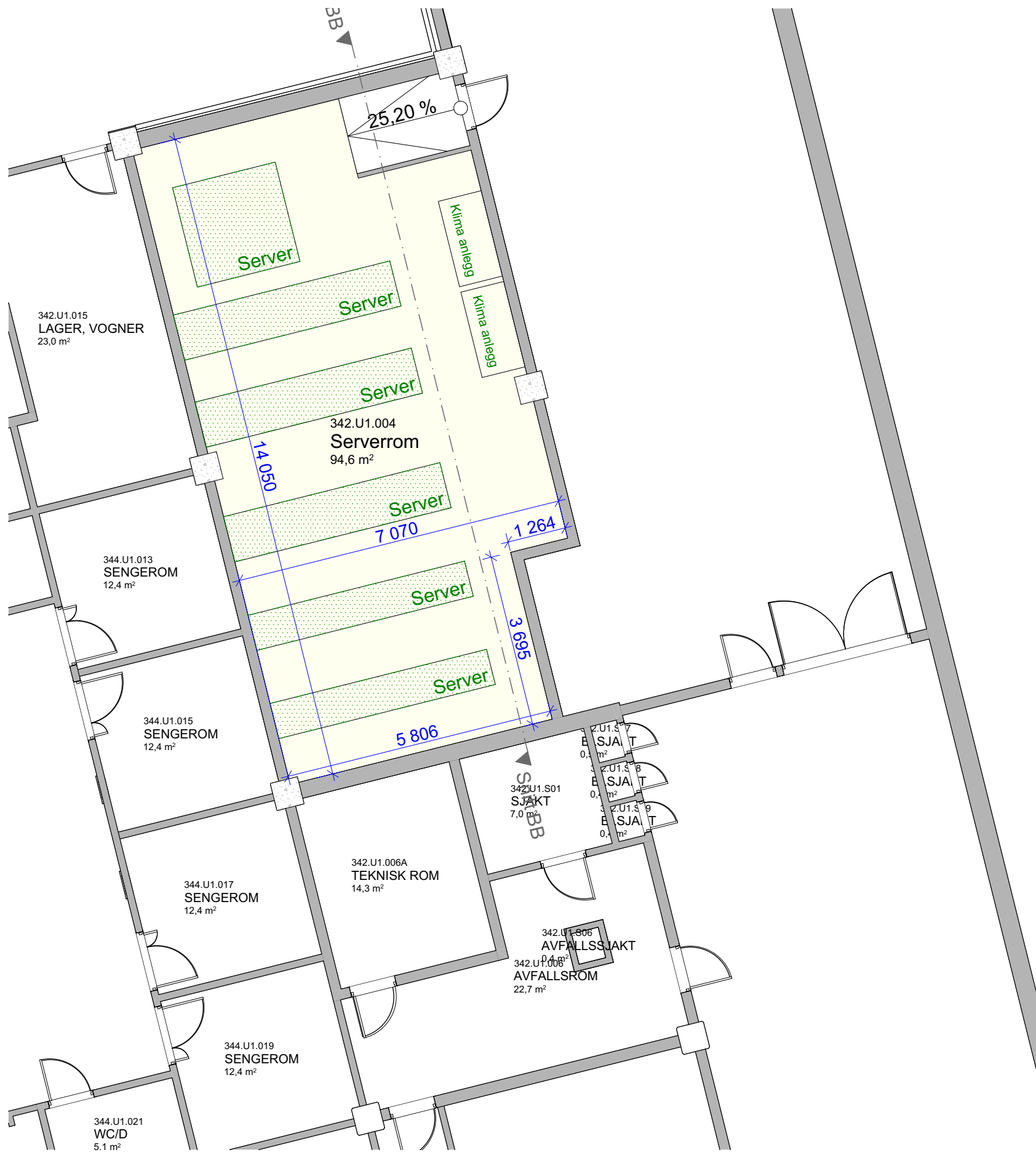
Akuttjen - Hjerte - Lunge - Senteret - plan U1 - lokalisering