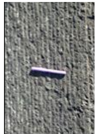
Figure 1: Finely milled substrate