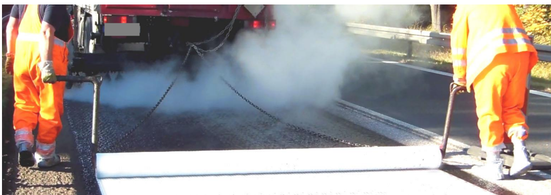
Figure 5: Manual installation with chains and 'Z' bars

For longer lengths the manual process can be aided by connecting the roll to the bond coat spray truck using chains connected to a steel bar passed through the roll core (see Figure 5) with 'Z' shaped handles to control orientation.