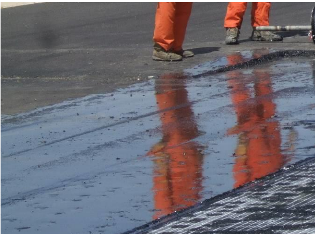
Figure 2: Mirror effect of fresh bond coat