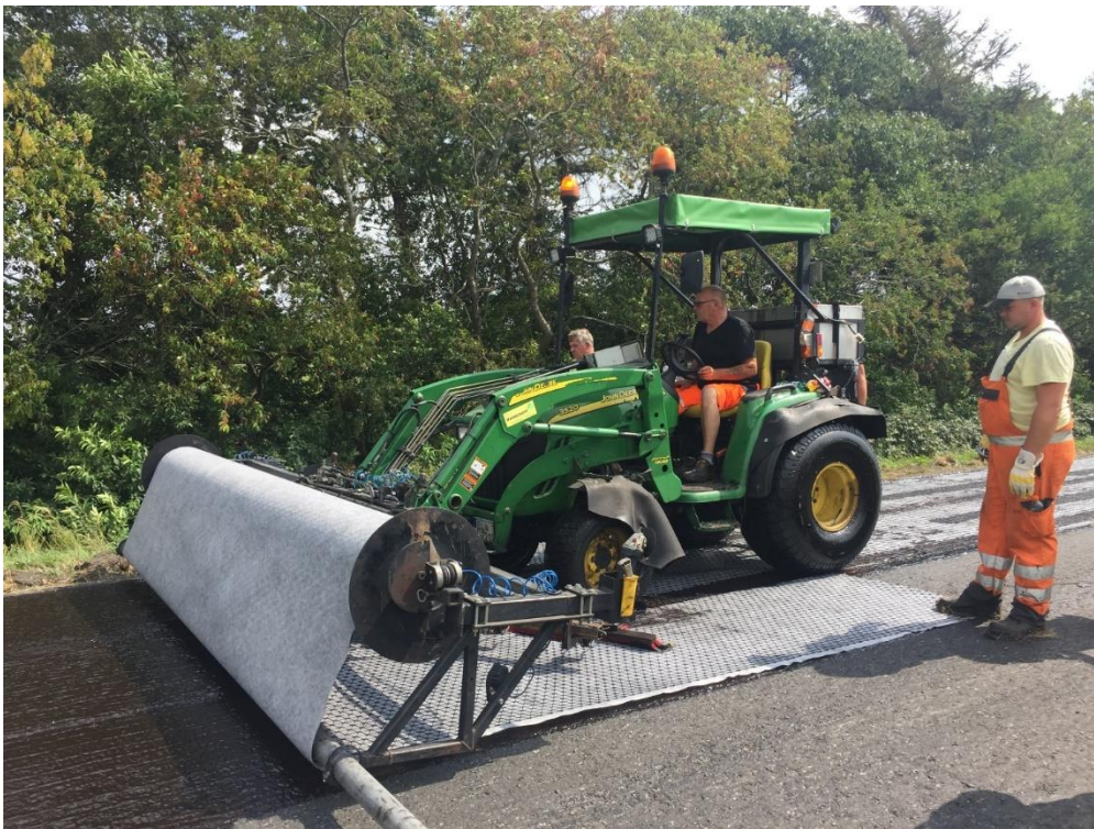
Figure 4: Mechanical Installation

The preferred method of installation is with a purpose-built interlayer installation machine (see Figure 4).