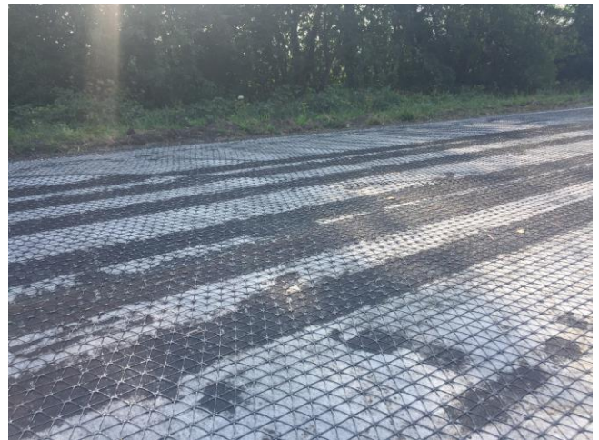
Figure 3: Black prints in the fabric after installations