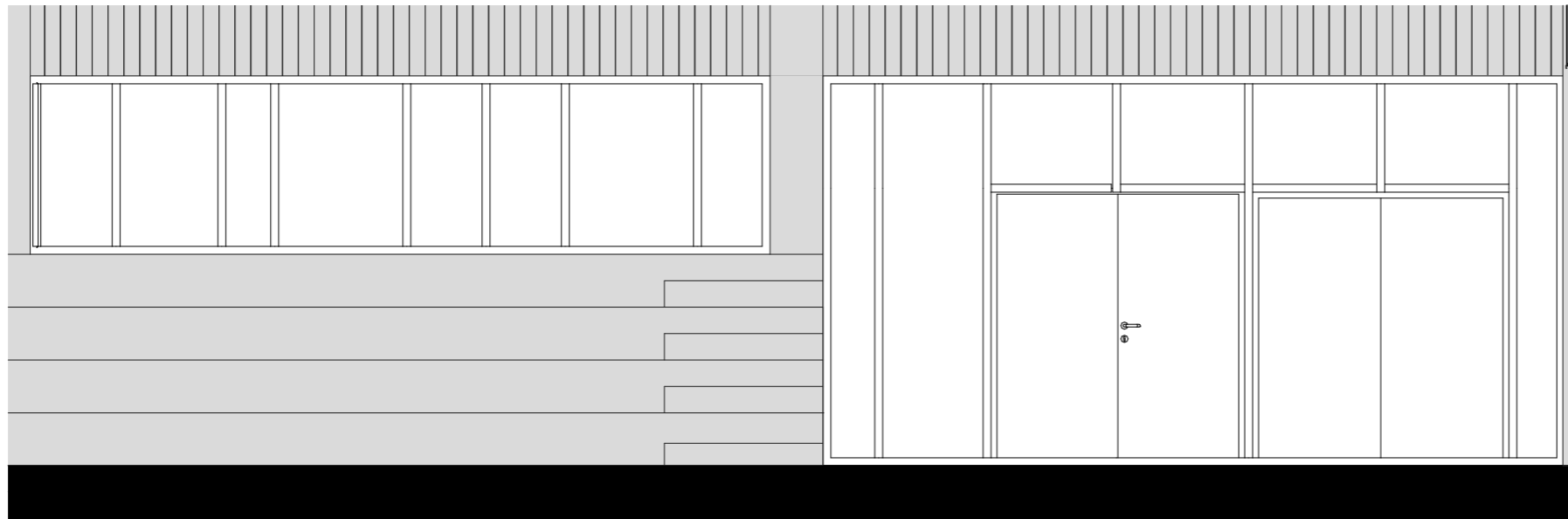
1:50 Vindusskjema, Plan 3 Akse A- 3/5